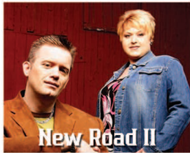
New Road II