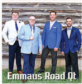
Emmaus Road Qt.