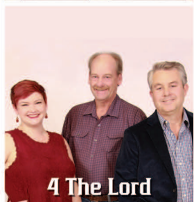
4 The Lord